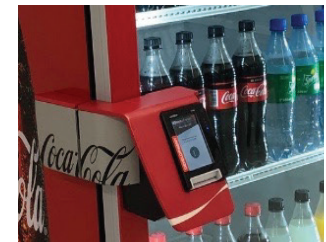
Optional Payment Terminal